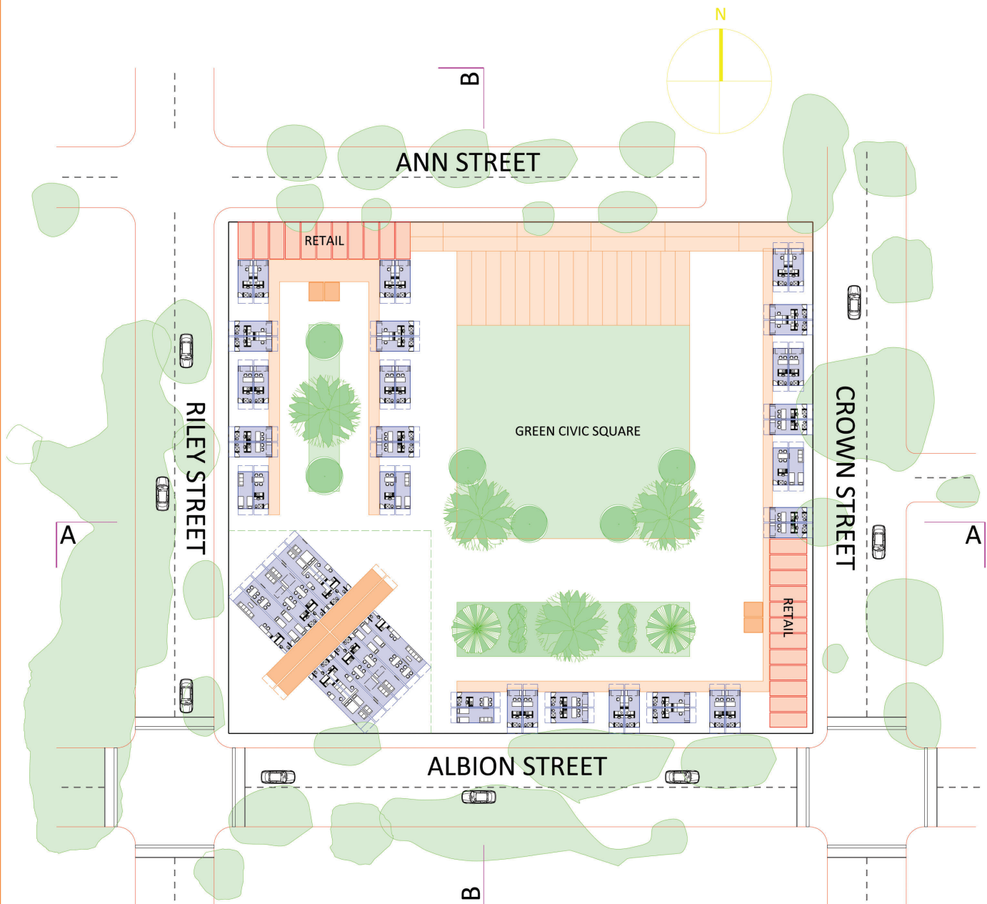
SITE AND GROUND FLOOR - NTS